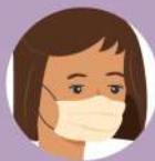
Adjust the mask without leaving gaps on the sides