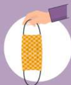
Inspect the mask for damage or if dirty