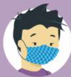
Cover mouth, nose and chin