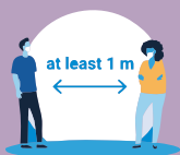
Maintain a distance of at least 1 metre from others