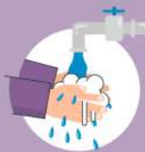
Clean hands before removing the mask