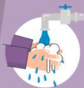
Clean hands before touching the mask