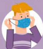
Remove the mask by the straps