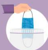
Store the mask in a clean bag or container