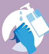
Clean hands frequently