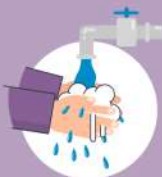
Clean hands after removing the mask