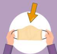
Identify the inside of the mask which will touch the face and the upper part that will cover the nose