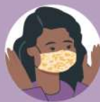
Avoid touching the front of the mask