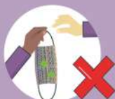
Do not share masks with others