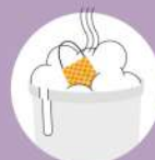
Wash the mask at least once a day, preferably with hot water